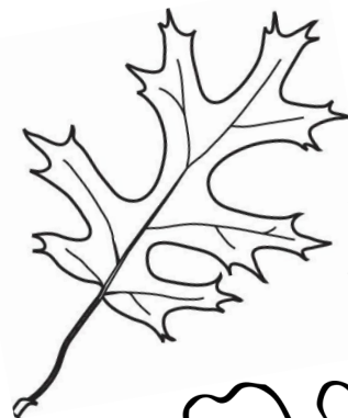
Red oak leaves typically have pointed lobes.

Oak wilt kills trees in the red oak group (red, black and northern pin oaks), and also harms trees in the white oak group (white, bur and swamp white oaks).